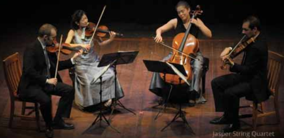
Jasper String Quartet

Don't miss the debut of a commissioned work written by Pulitzer Prize winning composer, Aaron Jay Kernis!