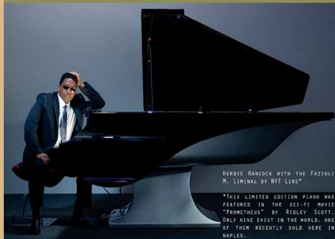
HERBIE HANCOCK WITH THE FAZIOLI M. LIMINAL BY NYT LINE*

Sublime. Intuitive. Limitless. Fazioli. In a league of its own.